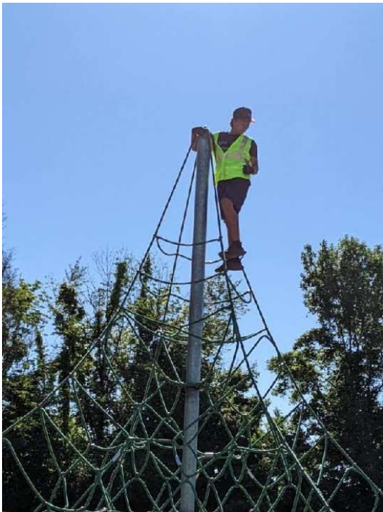
Believe it or not there's trash up here