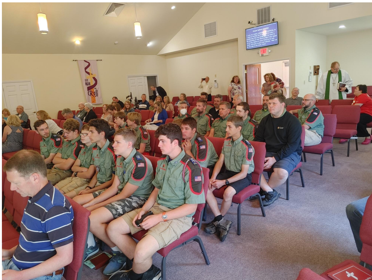
They joined us for worship