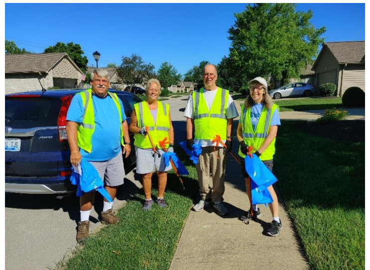
Not much trash in that neighborhood!!!!!!