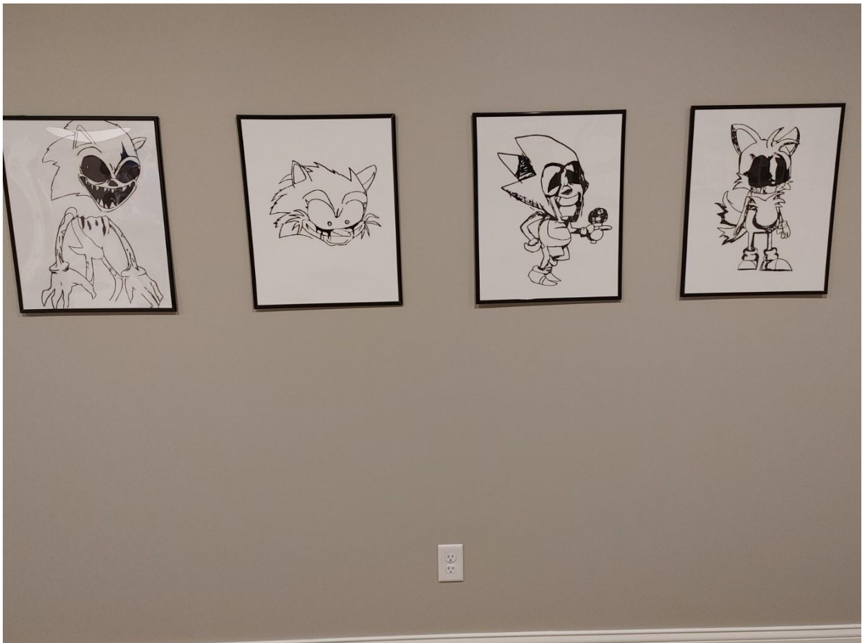
Grant's Art Work