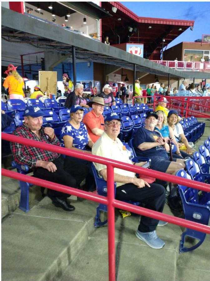
O.W.L.S. at the Ball Park