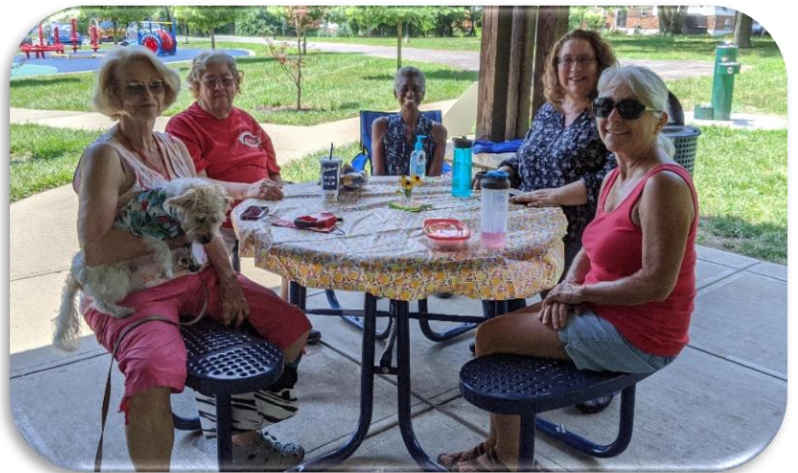
Sunday Morning Women's Bible Study Lunch in the Park