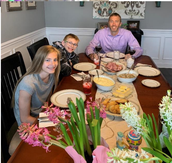
The Vonderlag Family