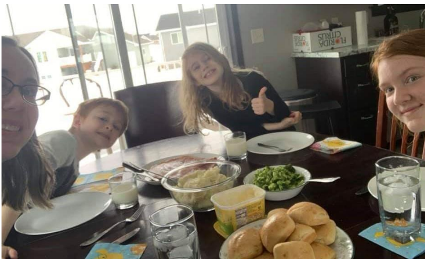
The Olson Family