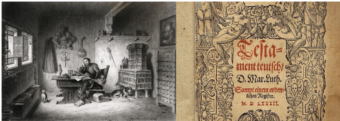
Pictured above, Martin Luther translating the Scriptures at Wartburg Castle and the cover page of his German New Testament

As many of you know, 2022 marks the 500 th anniversary of Dr. Martin Luther's translation of the Greek New Testament into the language of his German parishioners. While reading about this historic achievement, I came across a comment by Luther about how his translation of the New Testament had changed the world in a way I had never thought about. He Writes,