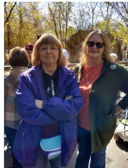
O.W.L.S at the ZoO